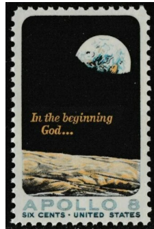
USPS Commemorative Stamp